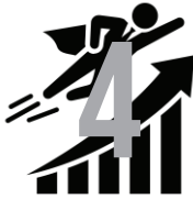
THE GROWTH OF THE MAJORITY WORLD