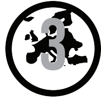
THE POSTMODERN POST-CHRISTIAN INFLUENCE OF THE WEST