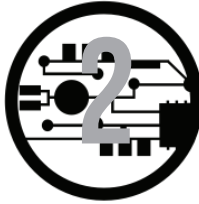
THE ADVENT OF MODERN TECHNOLOGIES