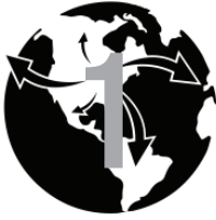
THE GLOBALIZATION OF THE WORLD